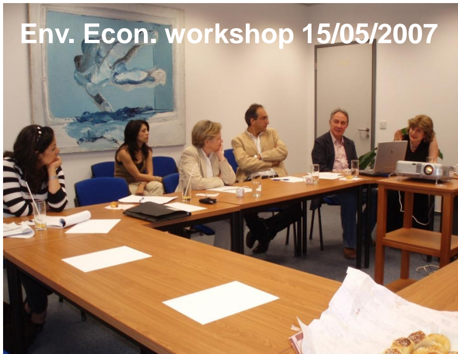
Env. Econ. workshop 15/05/2007