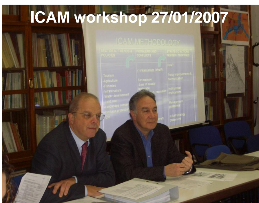
ICAM workshop 27/01/2007