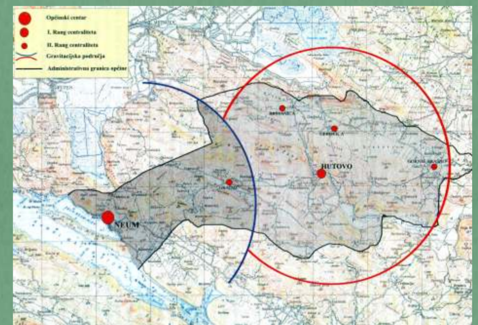
Bosnia and Herzegovina: Spatial Development Model of Neum Municipality