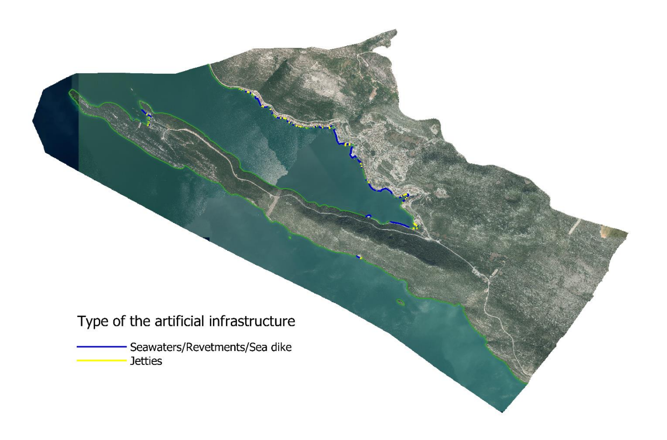
Figure 6 Spatial presentation of artificial infrastructure by type

the artificial coast in the settlement of Neum, and the majority of the natural coast on the Klek peninsula.