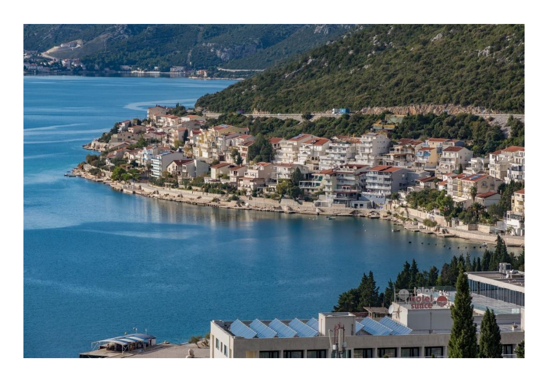
Figure 2 Neum