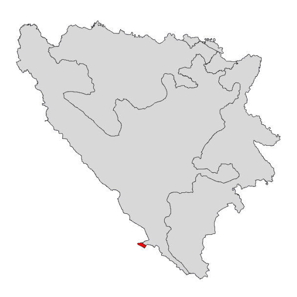
Figure 1 Bosnia and Herzegovina with location of the cadastral municipality Neum and associated sea in red

This small part of the coast is very indented like the rest of the coastline of the neighboring Republic of Croatia on the Adriatic Sea. Coast is geomorphologically built of cliffs, capes and accumulated pebble beaches.