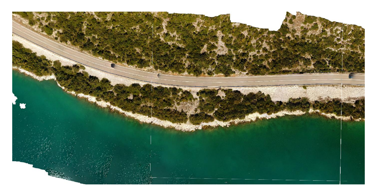
Figure 3 Part of the orthophoto showing the natural part of the coast

The length of artificial coastline has been calculated as the sum of segments on reference coastline identified as the intersection of polylines representing humanmade structures with reference coastline ignoring polylines representing humanmade structures with no intersection with reference coastline. The minimum distance between coastal defence structures is set to 10 m in order to classify such segments as natural, i.e. if the distance between two adjacent coastal defence structures is less than 10 m, all the segment including both coastal defence structures is classified as artificial.