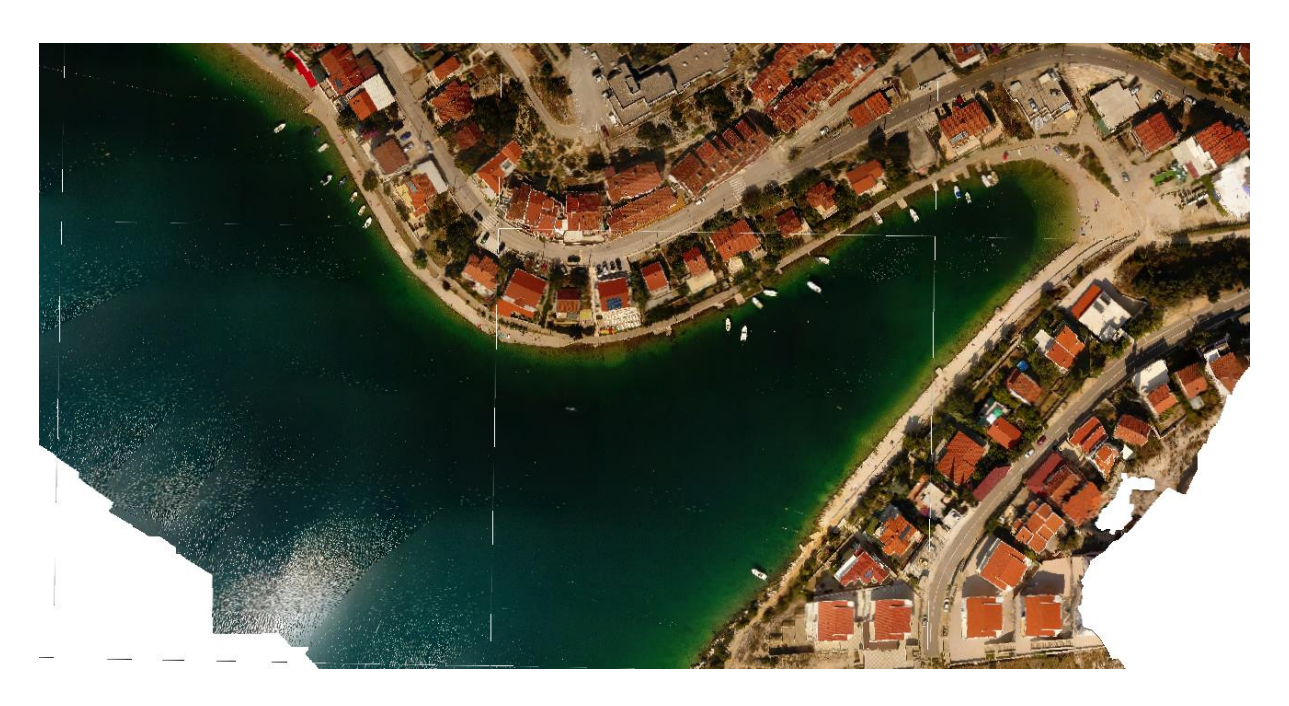
Figure 4 Part of the orthophoto showing the artificial part of the coast