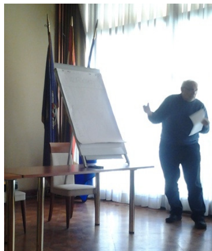
The floor was given to participants to express their opinions about issues in the county.

After lunch, work continued in four working groups with 10-12 participants in each. One participant from PAP RAC / NGO / Ministries / Universities / Planning institutes / Biologists / Fishermen, etc. took part in each group. A general observation is that a few local socio-economic representatives attended the workshop, but that there were more institutional representatives.