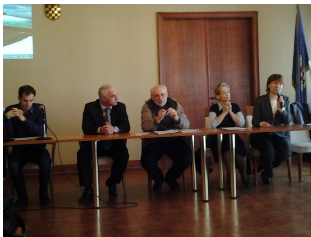
Introductory words, Šibenik, 8 th April 2013.