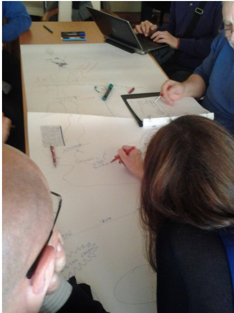
Working group sessions in order to draw “rich pictures”.

climate changes are already present in coastal Šibenik-Knin County zone. It is the fact which will help “ Climagine ” process to be fruitful on the next workshop.