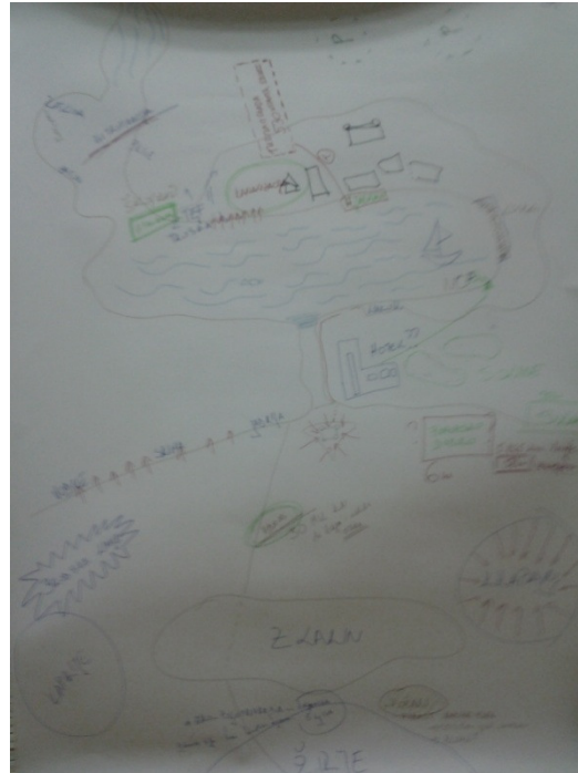
A “rich picture” from group 2. Schematization of the Sibenik-Knin County with texts and drawings.