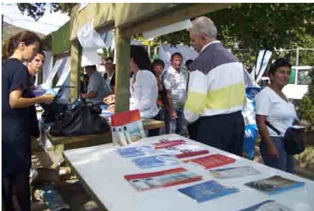
Photo 6: Promotion stands.