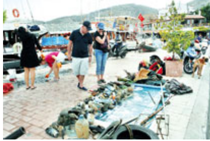
From car tires to plastic bottles, many astonishing waste was removed.

Datça, 3rd in the framework of Turkey's National Day of coastal, coastal and ocean floor was scrubbed. My Diving Center team of 12 people from Ankara Badi, Kargi bay dived in the morning. In the afternoon of Datca Center Harbor area is cleared. Tractor trailer full of garbage was removed.