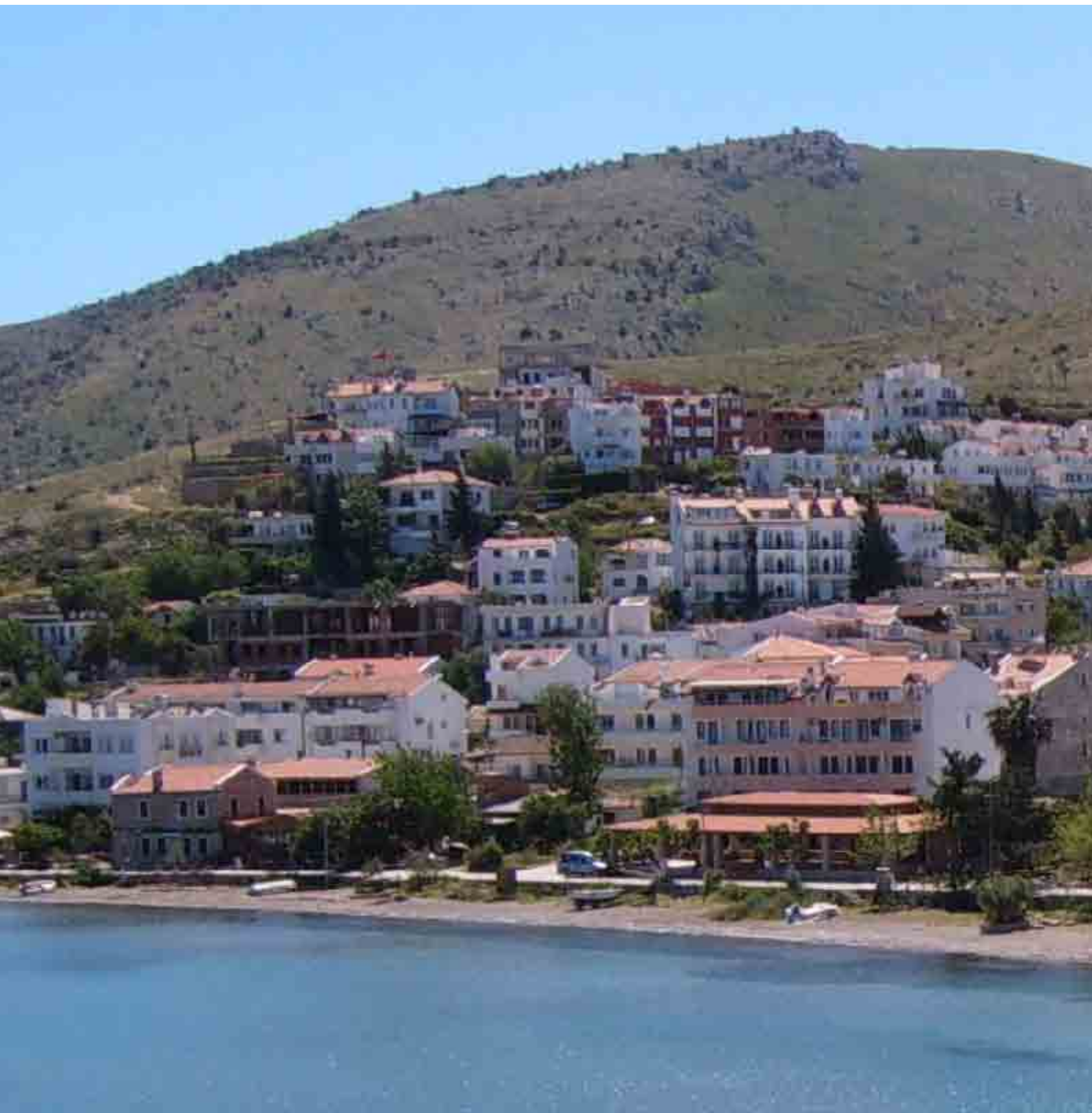
DATÇA, MUĞLA, TURKEY