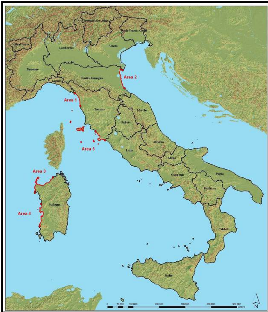
Figure 1. CAMP Italy Project Areas